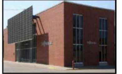
Clear Lake (605)874-2191

This paper printed for you by DNB NATIONAL BANK Gary and Clear Lake SD We want to thank them for this service!