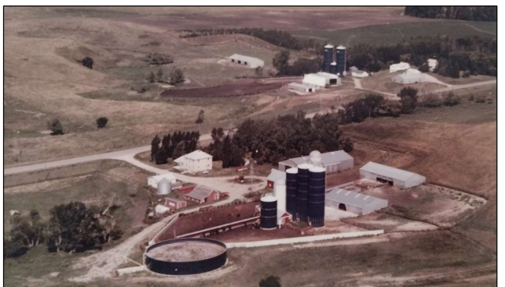
Both farms above were owned by the Fairchild family. The north farm passed down to grandson George Potz.

Most of these farms remain in their families today. The Fairchild brothers were avid outdoors men who enjoyed hunting, trapping and fishing. They raised mink, pheasants, geese, and bees and were modern day homesteaders as they built homes and outbuildings as well as sawmills and cider presses with their own designs. They all had a side hustle (often carpentry) to help support their families. The ten children added thirty-three grandchildren to the family tree. This third generation continues the tradition of building their own businesses to support their families and way of life. Countless great grandchildren have also come along, and the family tree continues to grow.