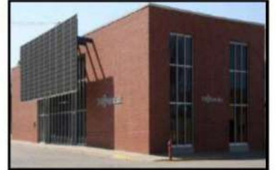
Clear Lake (605)874-2191

This paper printed for you by DNB NATIONAL BANK Gary and Clear Lake SD We want to thank them for this service!