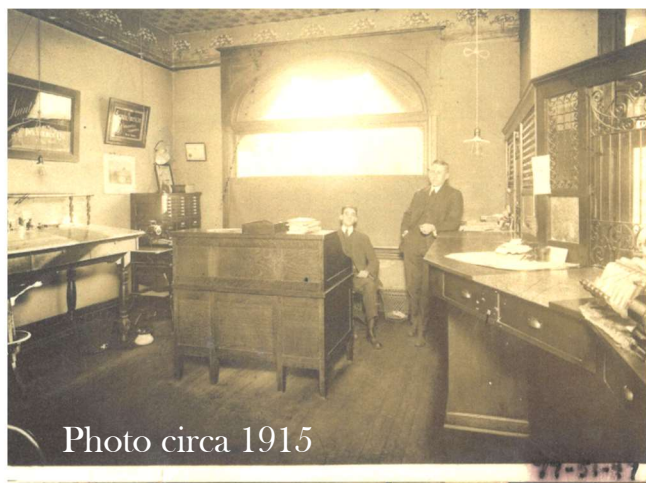
Photo circa 1915

The First National Bank of Gary, South Dakota was organized on March 1, 1909 and chartered on April 19, 1909. It succeeded the State Bank of Gary and opened for business on May 5, 1909. Another bank, the National Bank of Gary, South Dakota, had been organized as a conversion of the existing earlier Exchange Bank and was operating between 1916 and 1931