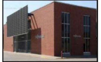
Clear Lake (605)874-2191

This paper printed for you by DNB NATIONAL BANK Gary and Clear Lake SD We want to thank them for this service!