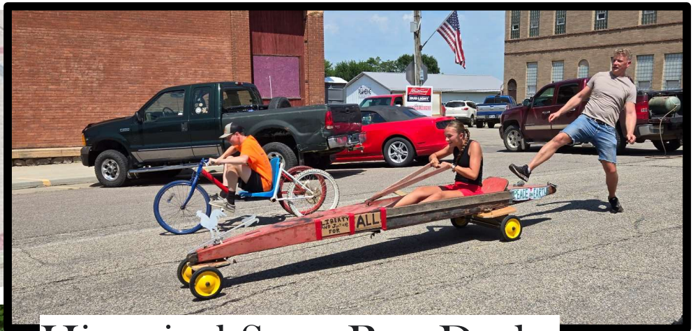
Historical Soap Box Derby