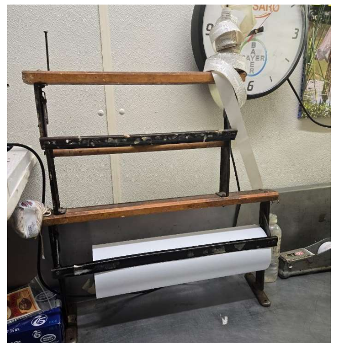
One of the few original pieces of equipment from Rob's earliest days - still located at Rob's Locker