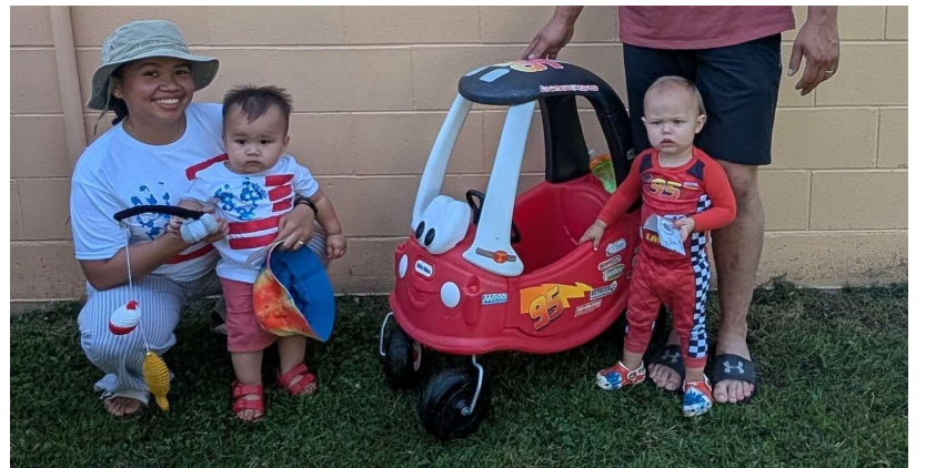
Kiddie Parade Cuties