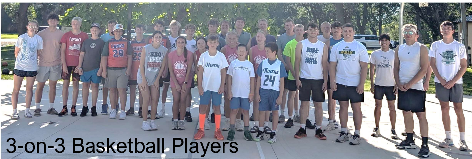
3-on-3 Basketball Players