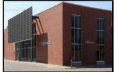
Clear Lake (605)874-2191

This paper printed for you by DNB NATIONAL BANK Gary and Clear Lake SD We want to thank them for this service!